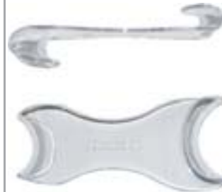
PHOTO Cheek Retractors

Double Ended Adult / Child Sized Autoclavable up to 270°F / 132°C 1 pair per pack Item # DT-155